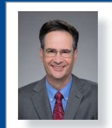
Senator Karl A. Rhoads